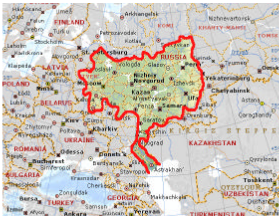
Figure: Volga River Basin

The project focus is on the Volga basin which comprises 40% of the population of Russia, 45% of the country's industry and 50% of its agriculture.