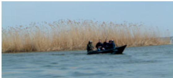
Figure: Excursion in the Volga Delta

The focus of this expert group is on environmental rehabilitation of large river basins with a special emphasis on improvement of water quality in the Volga river basin.